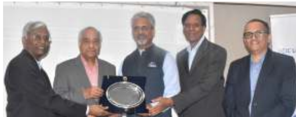
Special Talk by Hon. Justice B N Srikrishna Former Judge, Supreme Court of India