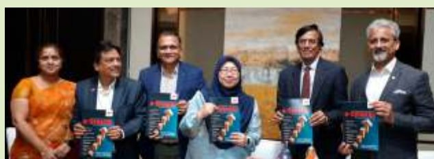
BCIC released its 20th Edition of e-synergy September 2023 by Hon'ble (Mrs.) Senator Fuziah Salleh, Deputy Minister of Domestic Trade & Cost of Living, Ministry of Domestic Trade & Cost of Living, Malaysia