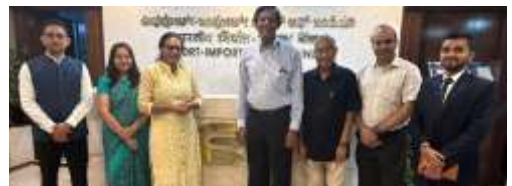
September 5, 2023: Interactive meeting with Sr. Representatives of EXIM Bank to discuss on the various schemes offered by EXIM Bank to Industry members