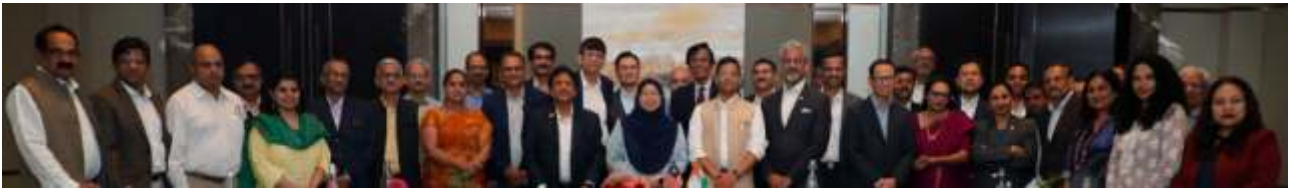
September 20, 2023: Special Talk by Ms. Senator Fuziah Salleh, Hon'ble Deputy Minister of Malaysia, Domestic Trade & Cost of Living, Malaysia at the session coinciding with meeting of MC