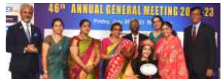
Ms. Anju Bobby George Athlete in recognition to her success in the World Championship in Athletics and for being the most inspirational athletes in the country's track and field history