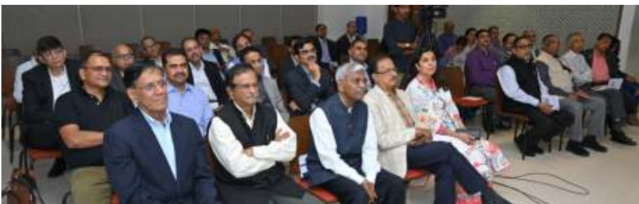
Section of Audience

Special Talk by Prof. M. V. Rajeev Gowda Former Member of Parliament - Rajya Sabha and Vice Chairman, State Institute for Transformation of Karnataka