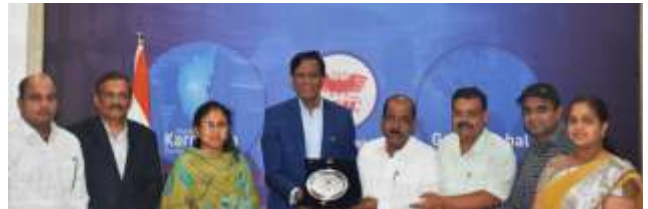
November 17, 2023: Awareness session on Discounted Energy Rate scheme(DERS); Special Incentive Scheme(SIS) and Green Power by BESCOM