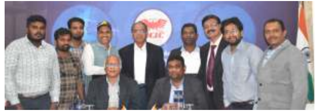
November 10, 2023: BCIC – Maxbyte Workshop on How to implement Lean 4.0 and Smart Manufacturing?