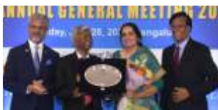
Brigade Hospitality Services Ltd