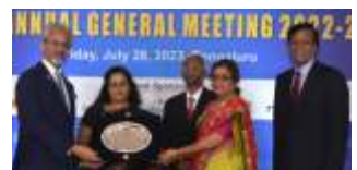
TVS Motor Co Ltd