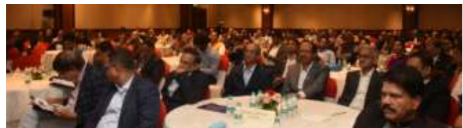
Section of Audience