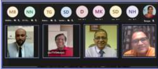
August 28, 2023: Webinar on Using Artificial Intelligence for improved productivity organized under the aegis of Industry Institute Interface (3i) & Edutech Expert Committee, BCIC.