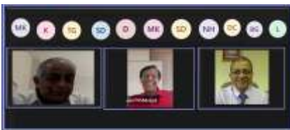
September 11, 2023: Webinar on ERP Environment, Internal Control and Risk Assessment organized under the aegis of Industry Institute Interface (3i) & Edutech Expert Committee, BCIC.