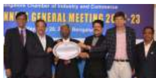
Wealthmax Group of Companies