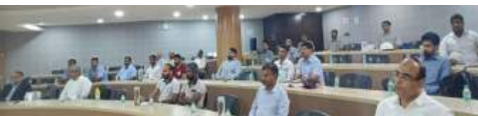
Section of Audience