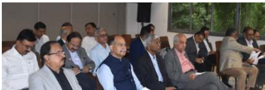
Section of Audience