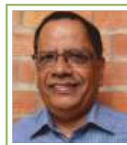
Gopal B Hosur, IPS, Retd