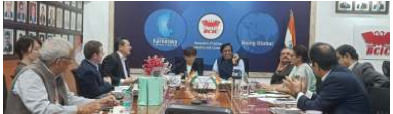
August 30, 2023: Interactive meeting with SMRJ Japan at BCIC Office