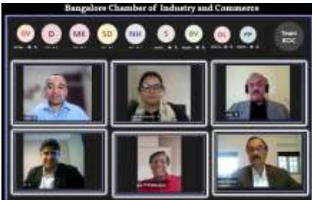
September 25, 2023: Webinar on Understanding the Digital Personal Data Protection Act, 2023 (DPDP Act)