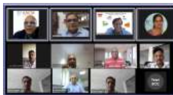
September 14, 2023: Webinar on Purpose of Industrial Automation & Emerging Job Roles organized under the joint aegis of Industry 4.0 Expert Committee & Industry Institute Interface (3i) & Edutech Expert Committee, BCIC.