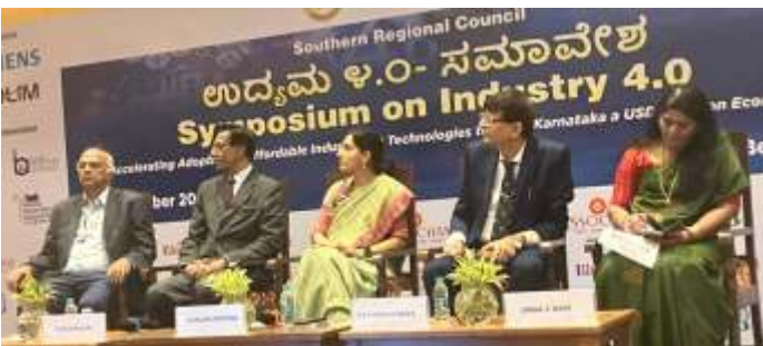
November 9, 2023: Industry 4.0 Conference organized by ASSOCHAM with BCIC as one of the Association Partner