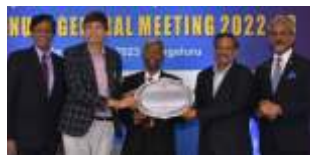
Special recognition to BCIC Japan Office