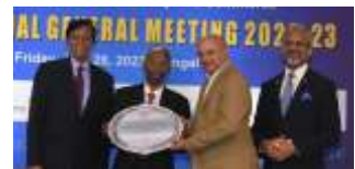
Special recognition to Amrita Vishwa Vidyapeetham