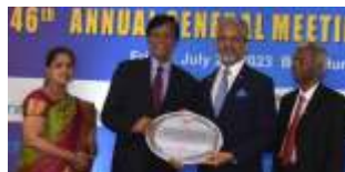
Special recognition to BCIC - Brigade BCIC Skill Development Academy (BBSDA)